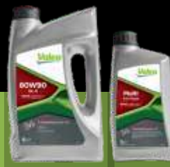
TRANSMISSION SYSTEMS OILS